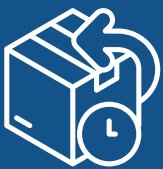
Retail Operations 零售業務營運