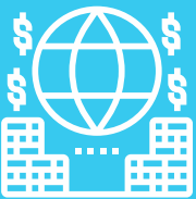
GBA Cross Border E-tailing 大灣區跨境零售