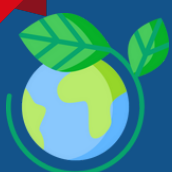
Eco-Friendly Retailing 推崇綠色零售