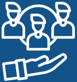
Customer Experience 顧客體驗