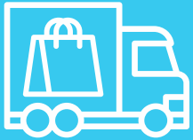
Order Fulfillment 交易履行