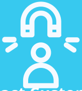
Attract Customers 吸引顧客